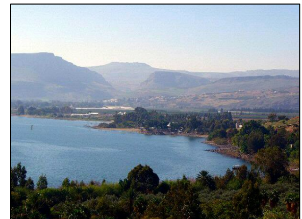
Sea of Galilee and Mt. Arbel

Come experience travel that offers you the chance to share the journey of a lifetime. Feed your soul and your senses as you enhance your personal relationship with God. Walk where Jesus walked and view history from a Biblical perspective.