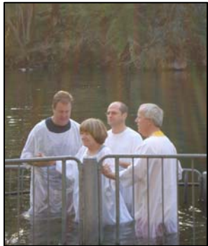
Experience baptism in the Jordan River just as Jesus did over 2,000 years ago

Imagine yourself surrounded by fellow believers and reliving historical Biblical events at the locations where they occurred. Don't pass up this once in a lifetime opportunity.