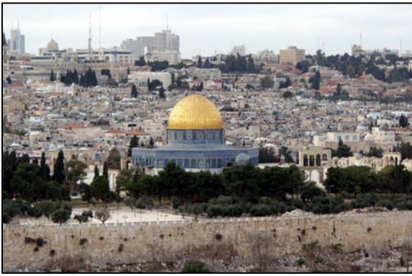
View Jerusalem from the Mount of Olives

Imagine yourself surrounded by fellow believers and reliving historical Biblical events at the locations where they occurred. Don't pass up this once in a lifetime opportunity.