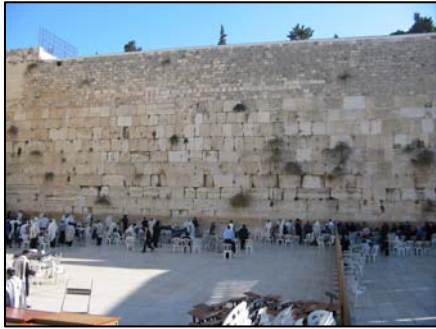
Pray at the most holy site in Jerusalem, the Western Wall of the Temple Mount

The 2010 In Living Color Tour focuses on Biblical and archaeological sites. Pray in the Garden of Gethsemane, drink from Gideon's Spring, and swim in the Dead Sea.