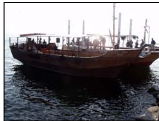
Sailing on the Sea of Galilee