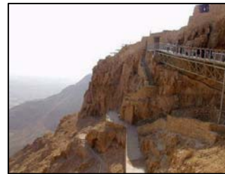
The View from Masada

We have been blessed to secure Itai Levi as our guide. Itai, a Messianic Jew and Israeli war veteran, will use the Scriptures as our tour guide.